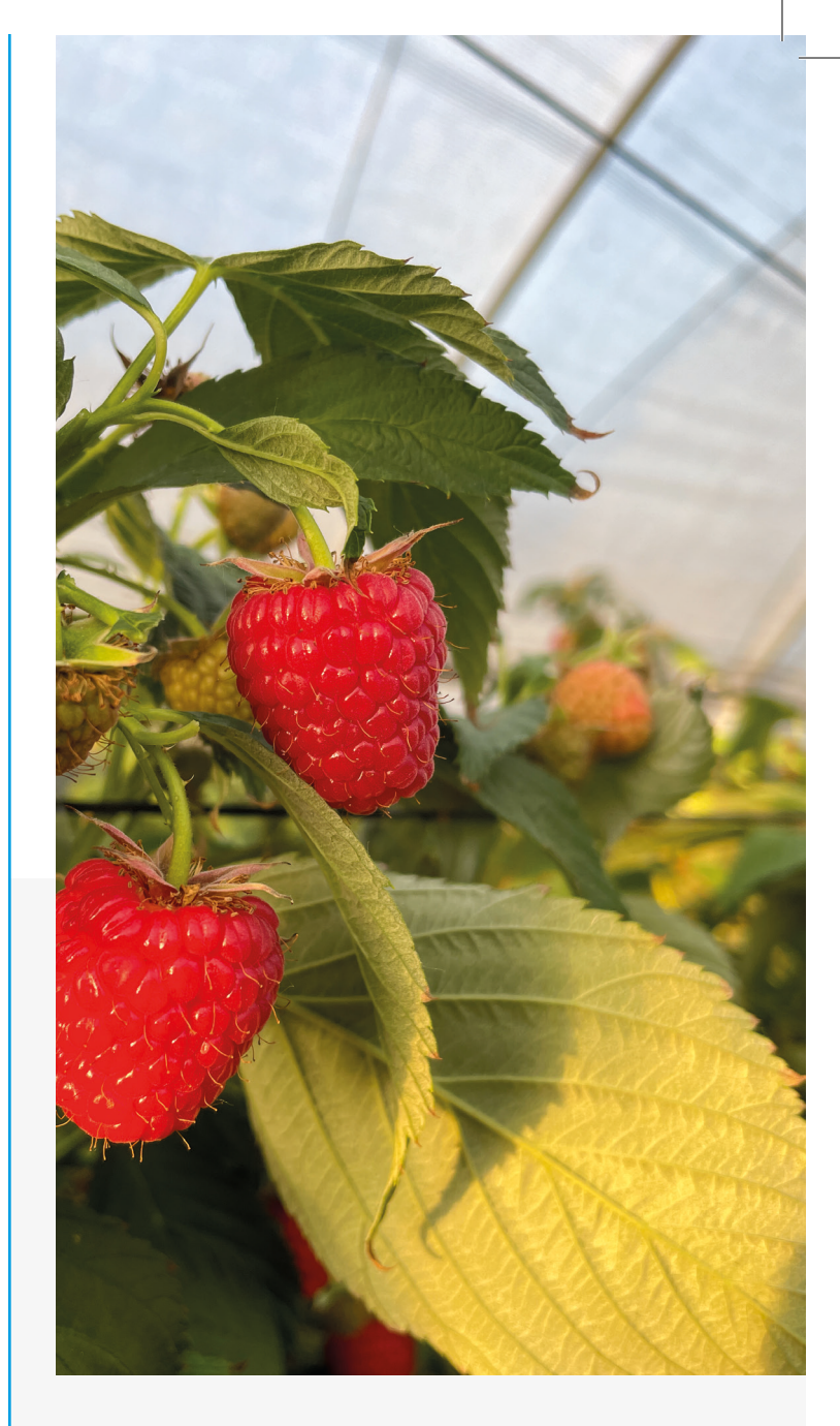
The picking of the fruit is facilitated and together with its consistency and the vegetative habitus, make the harvesting yields very high, reaching in spring 7.5 kg/h as the average throughout the cycle.